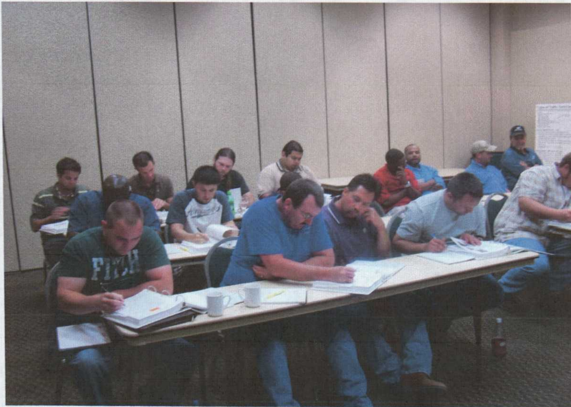
Work Zone Traffic Control class in Killeen, Texas June 2008