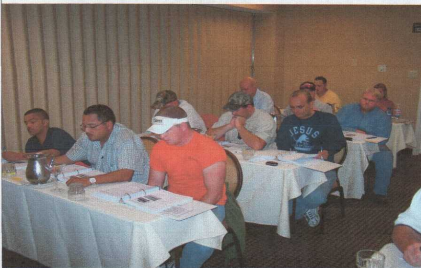
Part of the students attending Traffic Signals Level I, November 2008 in Fort Worth, Texas.